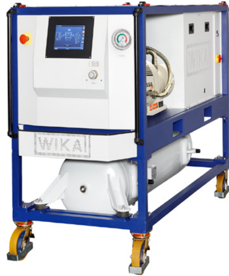
SF 6 service equipment with 300-litre tank