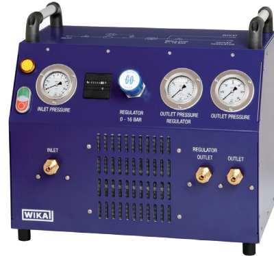
Portable SF 6 transfer unit, model GTU-10