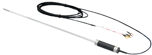
Standard platinum resistance thermometer, model CTP5000-T25

This four-terminal standard platinum resistance thermometer (SPRT) is designed to realise, with the highest accuracy, the International Temperature Scale ITS-90 over the range -196 \dots +660 \text{ }^\circ\text{C} [ -321 \dots +1,220 \text{ }^\circ\text{F} ] and is suitable for ITS-90 calibration up to a maximum temperature of 660.323 \text{ }^\circ\text{C} [ 1,220.581 \text{ }^\circ\text{F} ] (aluminium freezing point).