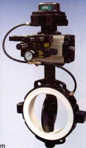
Open, unsealed, depressurized.