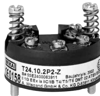
Type T24.10 Temperature Transmitters