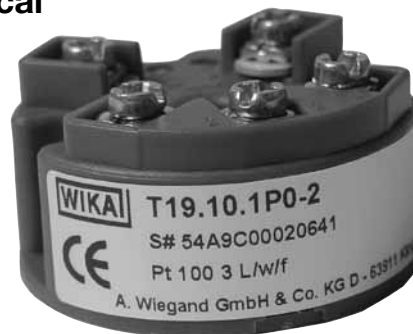
Type T19.10 Analog Temperature Transmitter