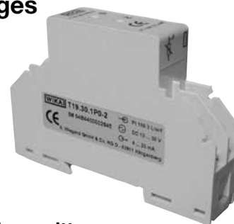
Type T19.30 Analog Temperature Transmitter