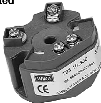
Type T23.10 Digital Temperature Transmitter