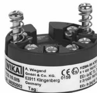
Type T53.10 Fieldbus Temperature Transmitter