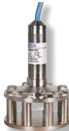
Liquid Level Transmitter with Anti-clog Attachment

For over 60 years, WIKA Instrument Corporation has continuously advanced pressure gauge, transmitter and temperature measurement instrumentation. As the global leader in lean manufacturing, WIKA offers a broad selection of stock and custom instrumentation solutions, which are often available for distribution within days. Producing over 43 million gauges, diaphragm seals, transmitters and thermometers worldwide annually, WIKA's extensive product line provides measurement solutions for any application. The WIKA sales team, along with its customer service and technical staff members, are ready to share their extensive product and industry knowledge to make your business experience with WIKA productive and progressive.