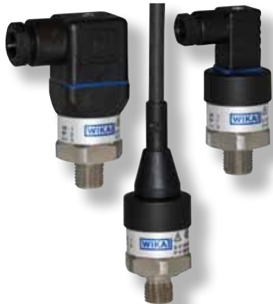
OEM Pressure Transmitter