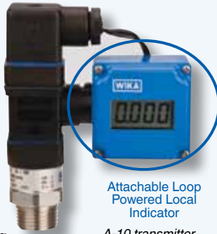
Attachable Loop Powered Local Indicator

For use with electronic pressure industrial S-10, S-11 and A-10 pressure transmitters with DIN plug.