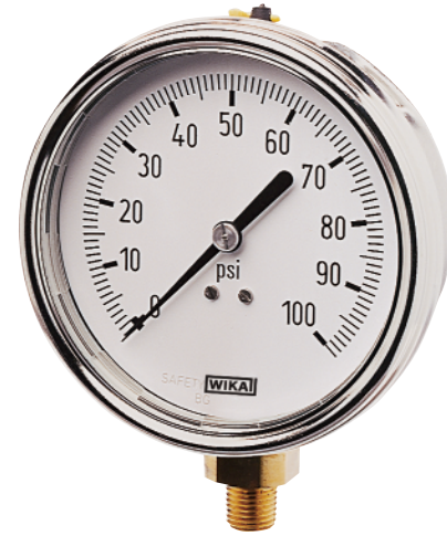
Bourdon Tube Pressure Gauge Model 21X.54