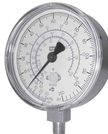
Bourdon Tube Pressure Gauge Type 111.10R